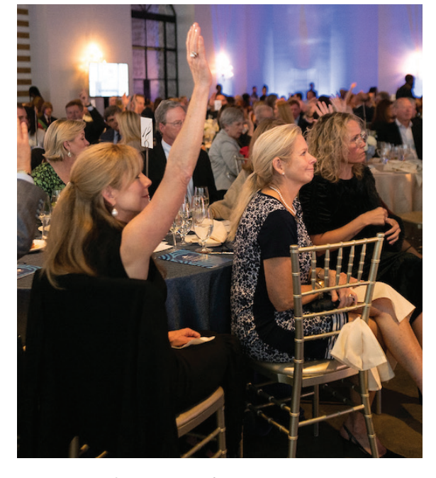
2023 Annual Dinner at The Revaire